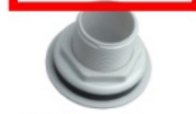
Two-piece base \phi 47