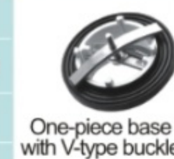
One-piece base with V-type buckle